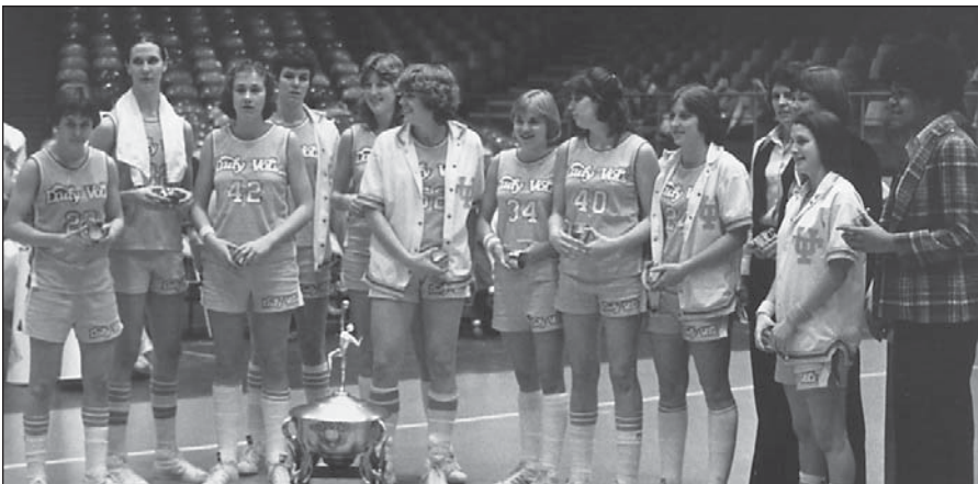
In 1980, the Tennessee Lady Vols captured the first-ever SEC Tournament Championship with an 85-71 victory over Ole Miss. Through the years, Tennessee has compiled the most victories in the competition, posting an overall record of 73-18 in tournament play, and the most tournament titles with 17.